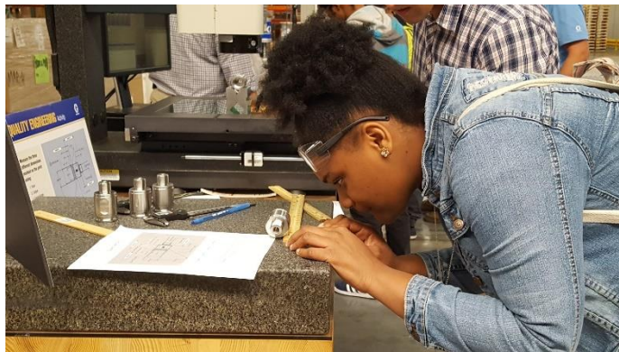
1Activity can be as simple as methods of measuring

Can the engaging activity be completed in 10 to 15 mins?