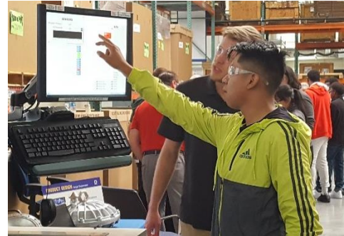
Youth making something work instead of watching