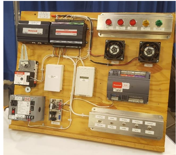
2 Interactive: find the faulty wire.